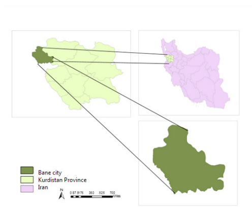
▲ Figure 1. Case Study Territory

and minimizes the weaknesses and threats of the system. This rationale, if employed correctly, will lead to positive outcome as for selecting and planning an effective strategy (Piers, 2002: 155). This method is a tool used for analysis of situation and planning a strategy. These affairs, in fact, can be carried out through: identification and classification of internal strengths and weakness, identification and classification of current opportunities and threats in system external environment, completing a SWOT Matrix and planning diverse strategies for system coaching in future. SWOT analysis tool can contribute significantly to identifying and planning strategies. SWOT method is a key tool for formulating strategic plans with help of which EFEM and IFEM are compared