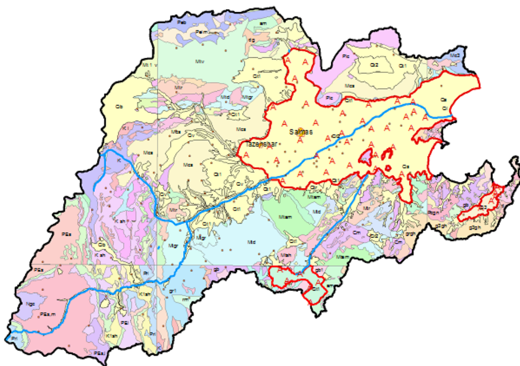
▲ Map1. The location of Basin and the plain of Salmas

200 m depth. Evaluation of pumping tests of 12 new wells in the plain of Salmas shows the increased amount of transmissivity of aquifer from margin to the Center of the Plain that is because of increased thickness of aquifer. In addition to the thickness of aquifer, along the Zola river, this increase can be effected by changes in way of gradation of alluvium and its high permeability. The maximum transmission capacity is more than 3000 square meters per day and a minimum is 50 square meters per day (at the edge of the plains) respectively. Calculated storage coefficients by exploration of wells do not have the appropriate spread on the plain. Salmas plain storage coefficient is estimated at around 3%. Formations with the possibility of storing water in them include Qom limestone formations and Ruteh with an approximate area of 150 square kilometers. Among Non-carbonate formations having storages with poor storage volume or being effective in nutriment of alluvial aquifers, Precambrian metamorphic rocks, sandstones of the Qom Formation and conglomerate and