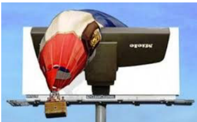
▲ Pic 1. Miele Vacuum cleaner. Three-dimensional advertising. (2011)