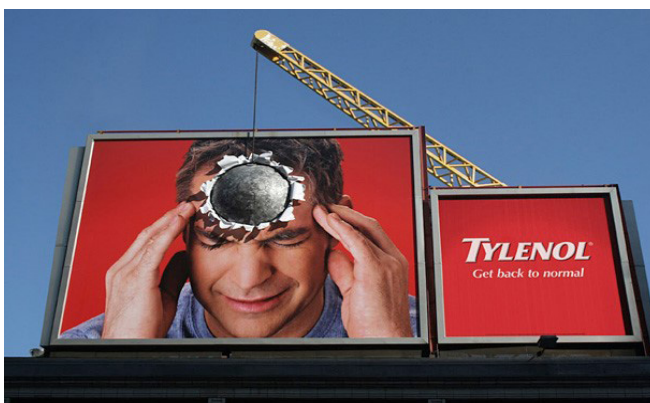
▲ Pic 4. Tylenol painkiller. Three-dimensional advertising. (2010).