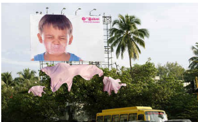
▲ Pic 2. Big Bobol Burst Chewing gum, Three-dimensional advertising (2007).