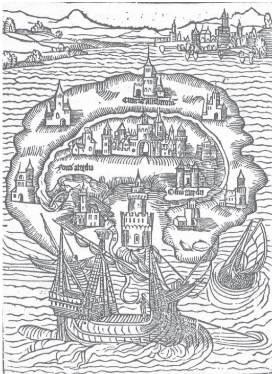
▲ Figure 1. First image of “utopia” from the publishing in the city of Leuven in 1516 (Bruce, 1999, 130)