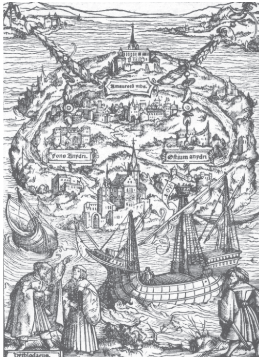
▲ Figure 2. Image of the “Utopia” in the editing the book in the city of Basel in 1518 (Bruce, 1999, 131)