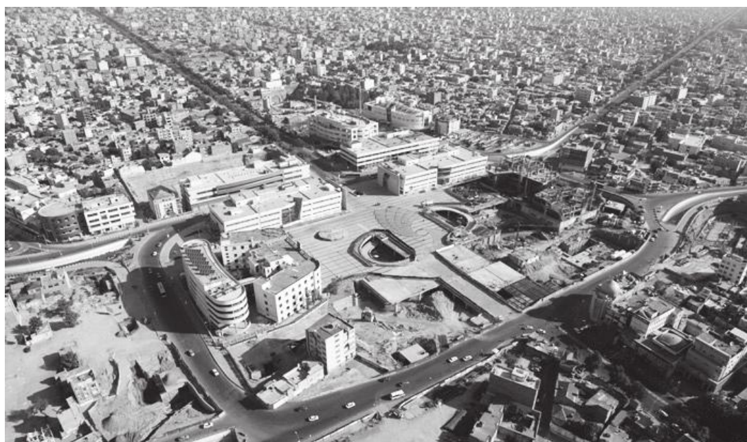
▲ Shape 5. Shohada Square