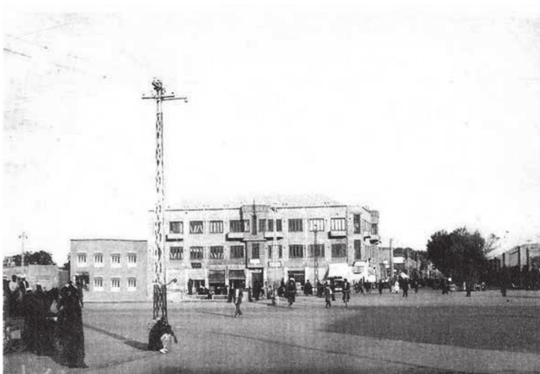
▲ Shape 3. Shohada Sqoure