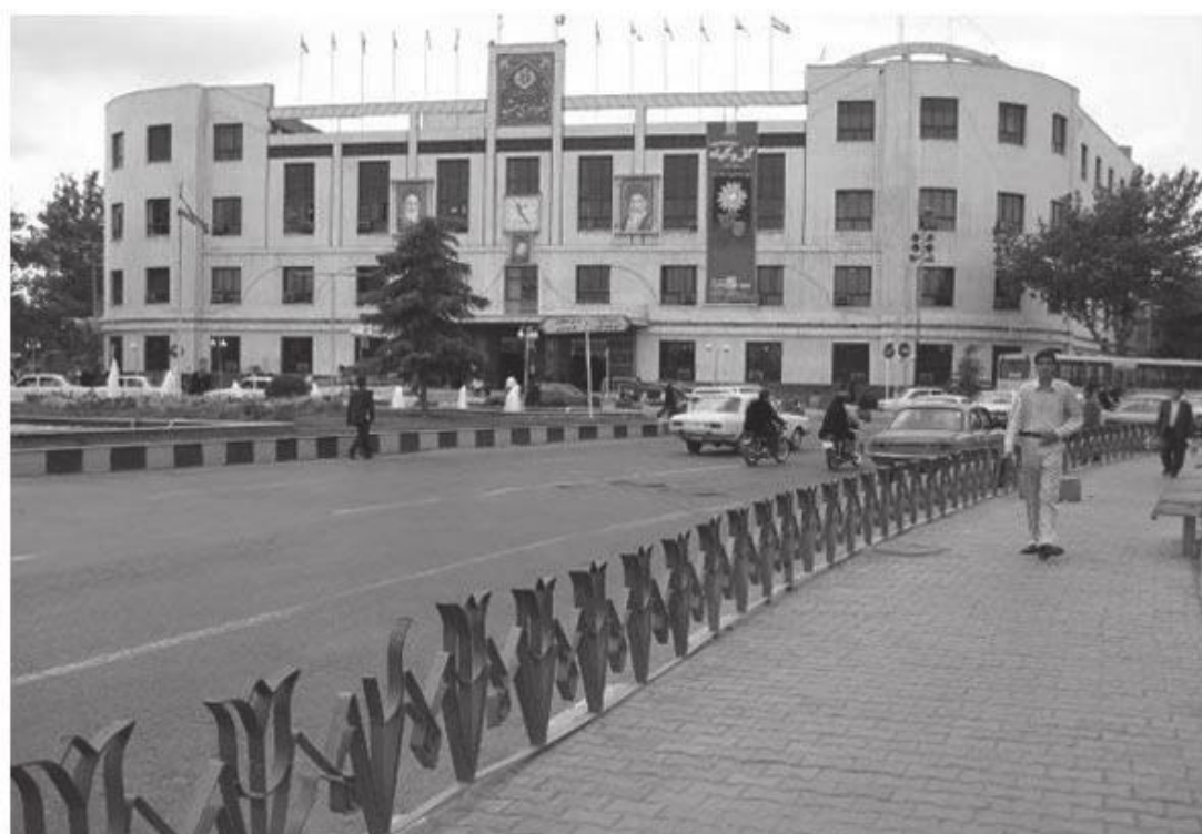
▲ Shape 4. Shohada Sqoure