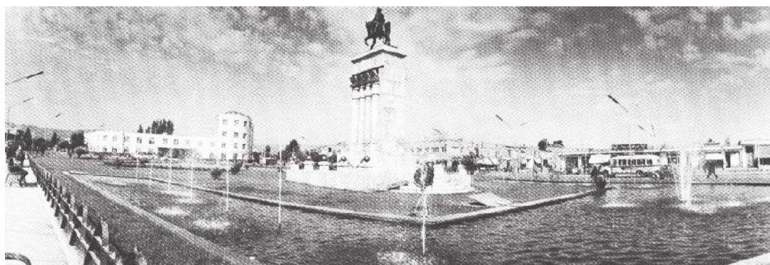
▲ Shape 1. Mojasame Sqoure, Source: Ab mantaghe archive

A Look at the Identity of Shohada Square The primary criteria for the design of such