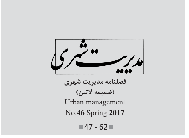
Received 6 Sep 2016; Accepted 11 Jan 2016