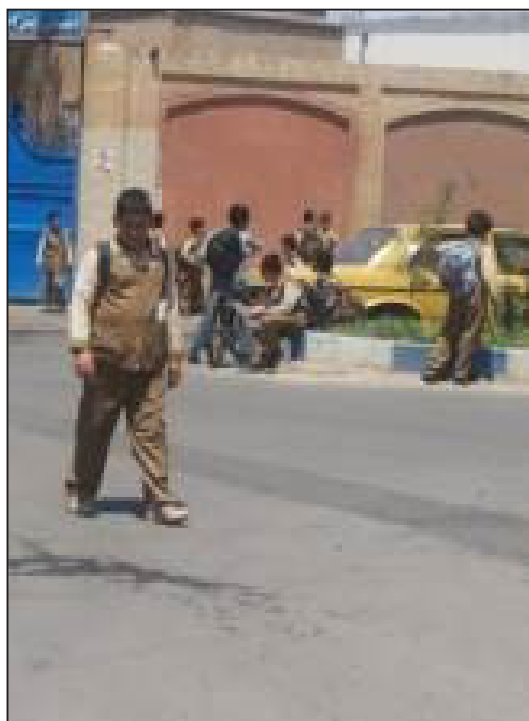
▲ Pic. 3 & 4: Sultan Mir-Ahmad neighborhood- students