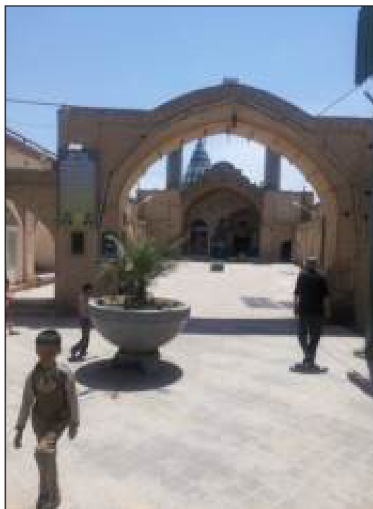
▲ Pic. 1 & 2: Sultan Mir-Ahmad neighborhood-newcomers & users