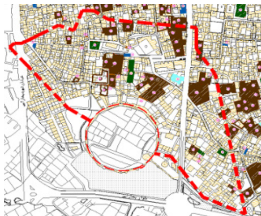
▲ Figure 4. Sultan Mir Ahmad neighbourhood

The following question then arises: what characteristics do the established correlations have with regard to the components derived from types of behaviours of user-environment and urban areas? Table 5 shows the correlation coefficient and indicates that correlation coefficient among the components of preferential, exploratory, awareness and components of urban space were in the range of 0.18 to 0.40 for urban users' behaviour, which is significant and positive at 0.05.