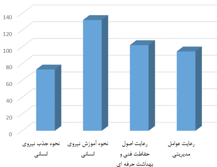
▲ Figure 1. Ranking of the main research criteria through Kruskal-Wallis test