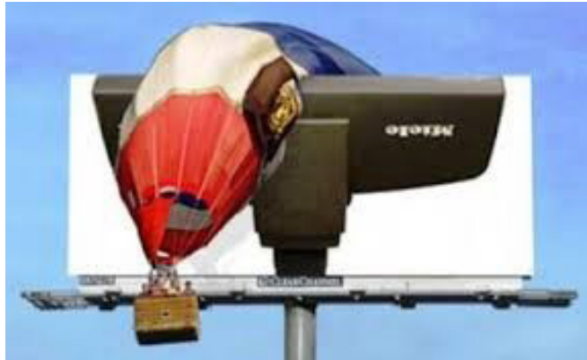
▲ Pic 1. Miele Vacuum cleaner. Three-dimensional advertising. (2011)