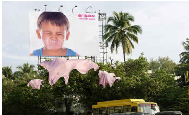
▲ Pic 2. Big Bobol Burst Chewing gum, Three-dimensional advertising (2007).