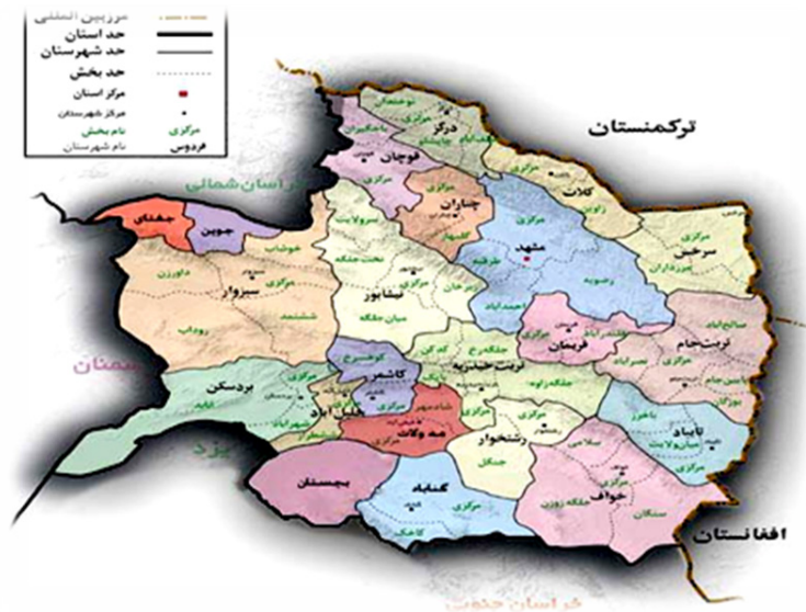
▲ Map 1. Neighborhood of Khorasan province with neighboring countries; (Source: www.khrorc.ir)