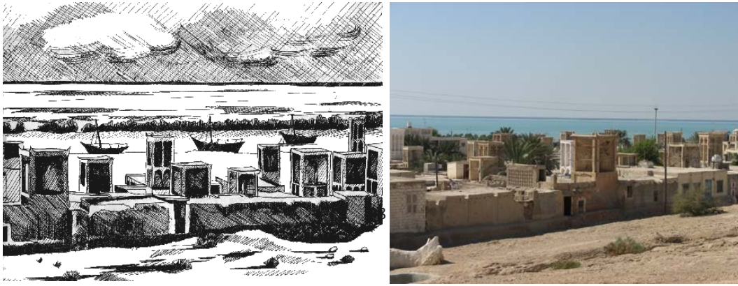
▲ Figure (3): the face of Laft port in the current situation and in the Qajar period, Source: (Lillian et al., 2010: 24).

ment, production continuity and prosperity crafts from time immemorial, Iran has played a role that is the existence of an economy based on agriculture and livestock. While the availability of raw materials for the manufacture of various types of vegetable and animal crafts, leisure and seasonal unemployment also causes generally can for crafts, provide good grounds for output and employment. Climatic conditions and climate variability and customs, customs and traditions in different regions and different crafts can create a variety of interesting and diverse images and designs to be effective. Iranian intrinsic interest in art, especially indigenous and traditional arts, which could pave the way for production or factor for demand works. Historically, each belonging to a specific period and show the impact of its cultural and artistic environment specific historical period and therefore today works with contemporary cultural treasures and the tablet is recorded as the actions and reactions of contemporary man, for future generations.